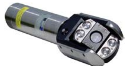
Operates with CUES OZIII & Nite Lite III Cameras