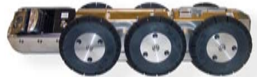
Compact Pipe Ranger in the 8" Configuration