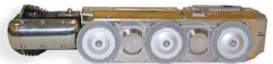
Compact Pipe Ranger in the 6" Steel Configuration