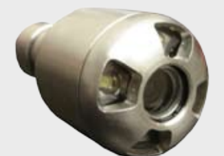
Jet Eye Camera Head (Strait-view, 4-LED bulb light, auto-leveling, Stainless steel housing)