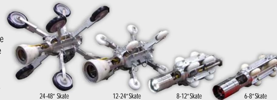
24-48" Skate 12-24" Skate 8-12" Skate 6-8" Skate

There are many Jet/TV Skates available for the Jet Eye camera system. The spread of these skates allows for operation in lines as small as 6" and as large as 48" (may require the use of additional light head for larger pipe). All of the skates can be switched by simply removing a locking pin and disconnecting the video cable. A stainless steel carrier protects the camera head in and out of the cleaning environment to keep crews running.