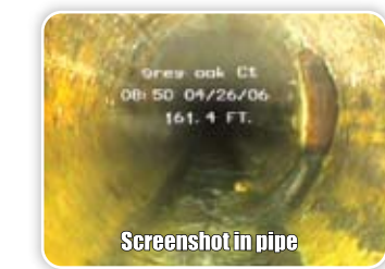
Screenshot in pipe

7" LCD viewer with keyboard for text on screen all in a watertight box