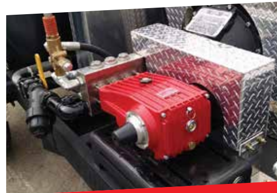
25 @ 4000 Pump Package