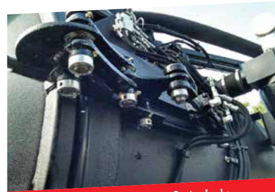
Adjustable Hydraulic Over-Center Locks