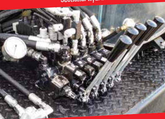
Sectional Hydraulic Valve