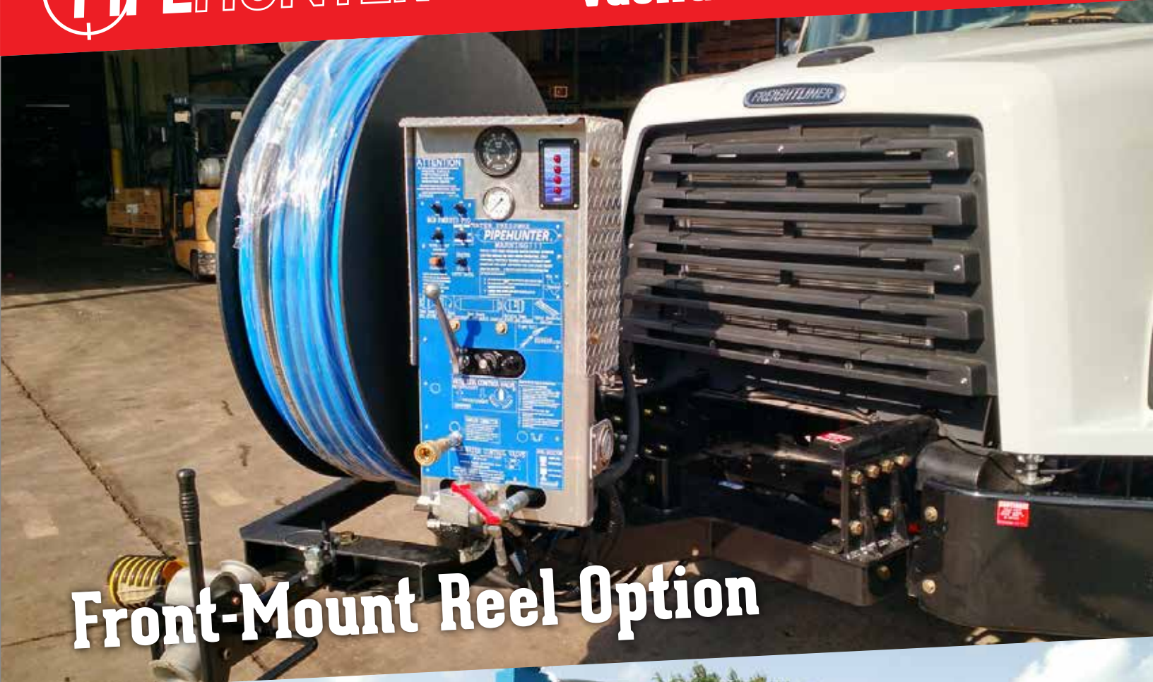
Front-Mount Reel Option