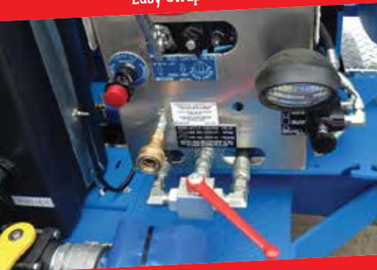
Easy Swap Main Ball Valve