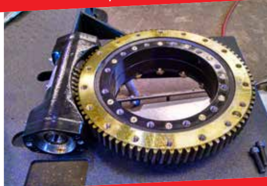
10" ID Hydraulic Slewing Bearing