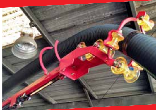
Boom End Roller Assembly