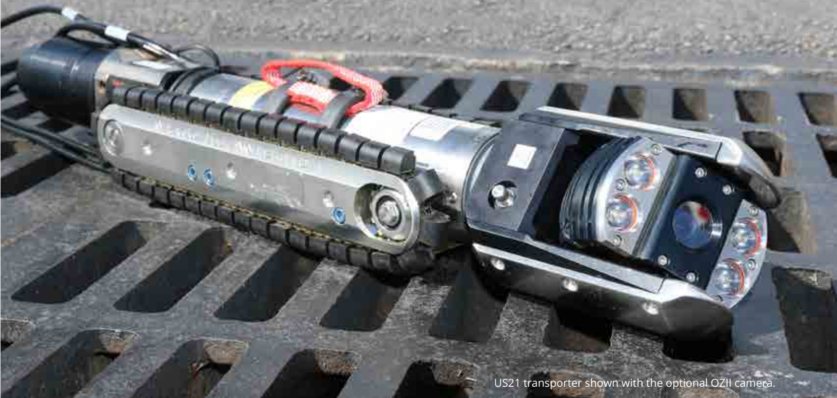
US21 transporter shown with the optional OZII camera.