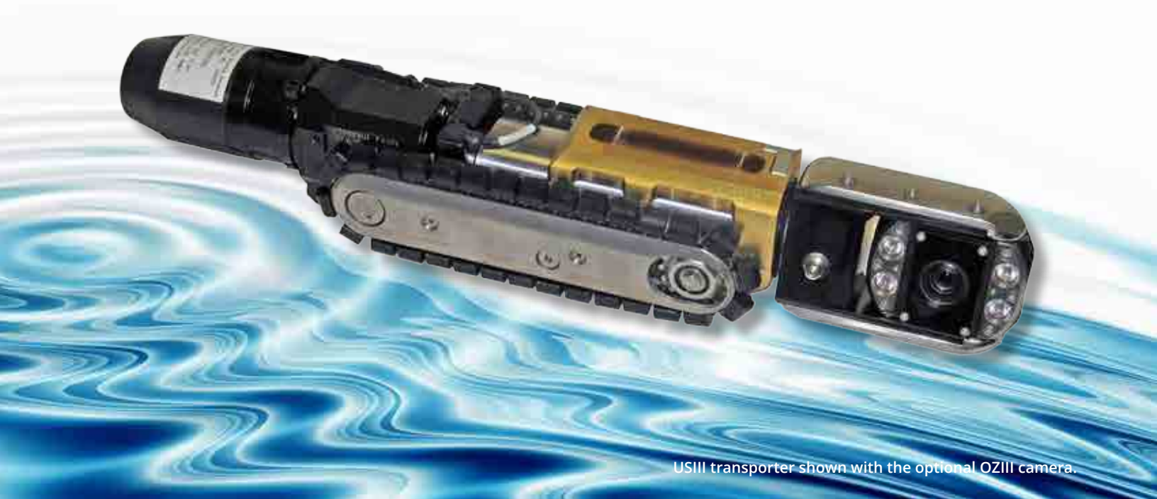
USIII transporter shown with the optional OZIII camera.