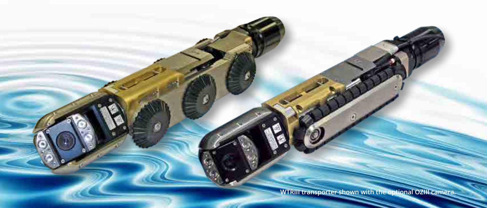
WTRIII transporter shown with the optional OZIII camera.