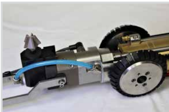
> WATER BLOW-OFF & WIPER