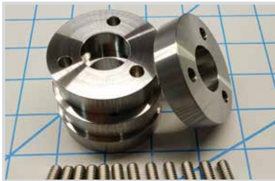
> OPTIONAL PARTS AVAILABLE