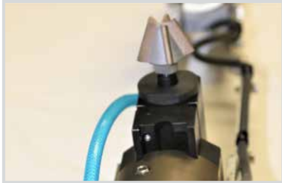
> VARIETY OF BITS AVAILABLE