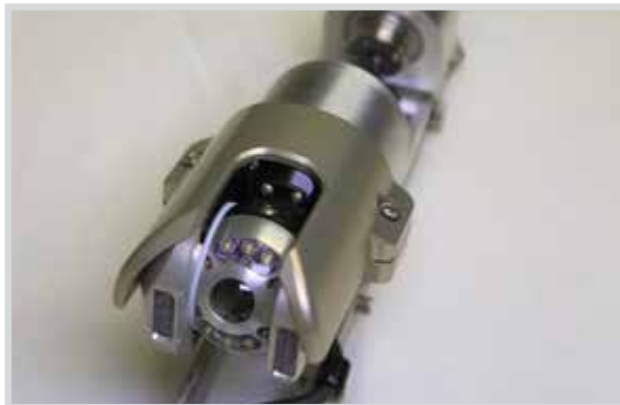
> CURRAHEE CUTTER CAMERA