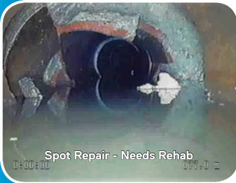
Spot Repair - Needs Rehab