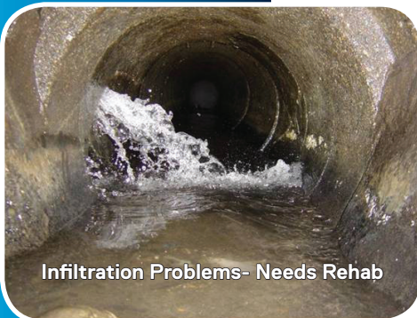
Infiltration Problems- Needs Rehab