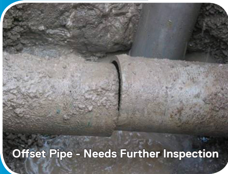
Offset Pipe - Needs Further Inspection