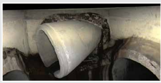
Video is stitched via the decision support software digital processing module and is available at the end of the inspection run. Virtual pan, tilt, and zoom of the entire surveyed manhole enables rapid condition assessment review -- significantly faster than traditional video inspection review.