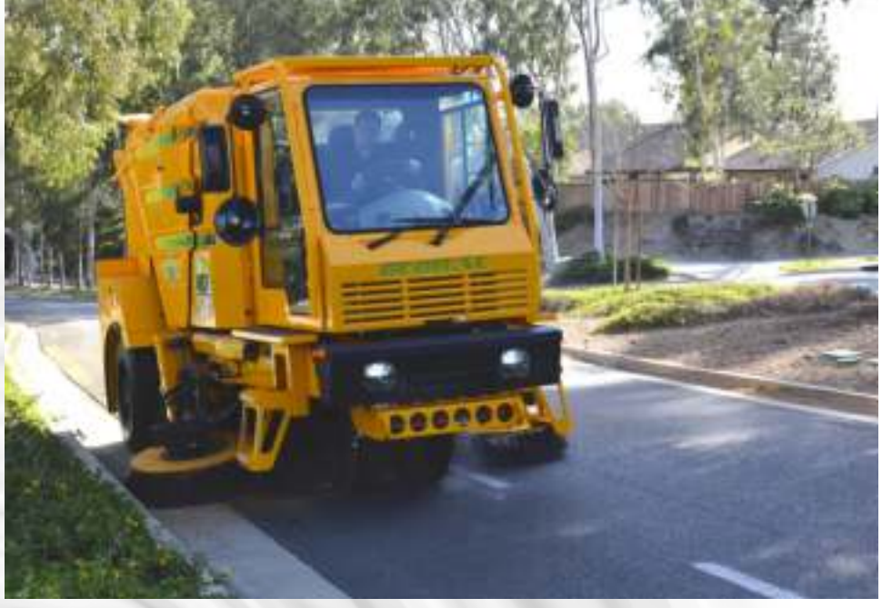
With travel speed of 25-MPH and a battery operational range of 9-11 hours, towns, villages and large cities will be able to clean the streets while protecting our environment and building a cleaner future with ZERO EMISSIONS. At the end of the shift just plug in the sweeper, recharge the batteries and sweep again.