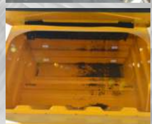
Global M3EV includes a 5.6 cu/yd hopper capacity compared to 4.5 culyd for competitive machines resulting in more curb miles swept between dump cycles. With near Full Useable Capacity, 12,000 Lift Capacity, and the Optional Elevator and Hopper Wash Out System, Global M3EV is Affordable, Reliable and Innovative.

HEAVY SWEEP PACKAGE Elevator Type: Standard 11 Flight squeegee with replaceable corded rubber tips; Continuous molded rubber belts combine with standard Heavy Sweep Package make Global M3EV the logical choice for sweeping heavy debris such as road millings, sand and gravel up to 3-tons per-minute . That Is one ton of sand every 20 seconds! Standard leaf gate system assists in picking up large debris, bottles, large branches and leaves.