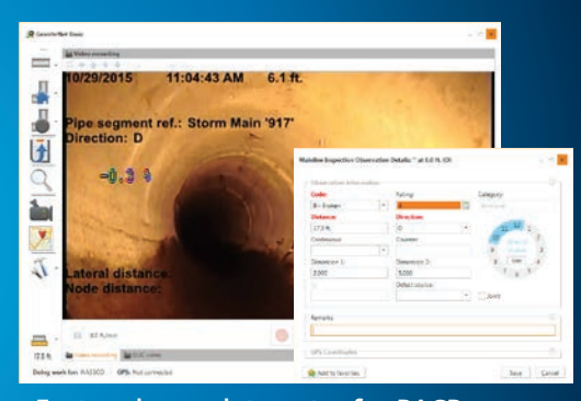
Fast and easy data entry for PACP, MACP & LACP

GRANITE NET ADVANCED EDITION: MORE SOPHISTICATED FOR USE IN THE OFFICE OR IN THE FIELD TO MAKE INFORMED DECISIONS.