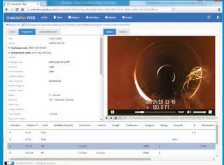
View completed inspection videos via the Internet from any browser, review tasks, run reports, filter, and search.