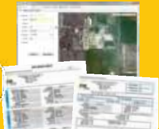
Detailed reports are produced from the data. Data is fully exportable in .csv format