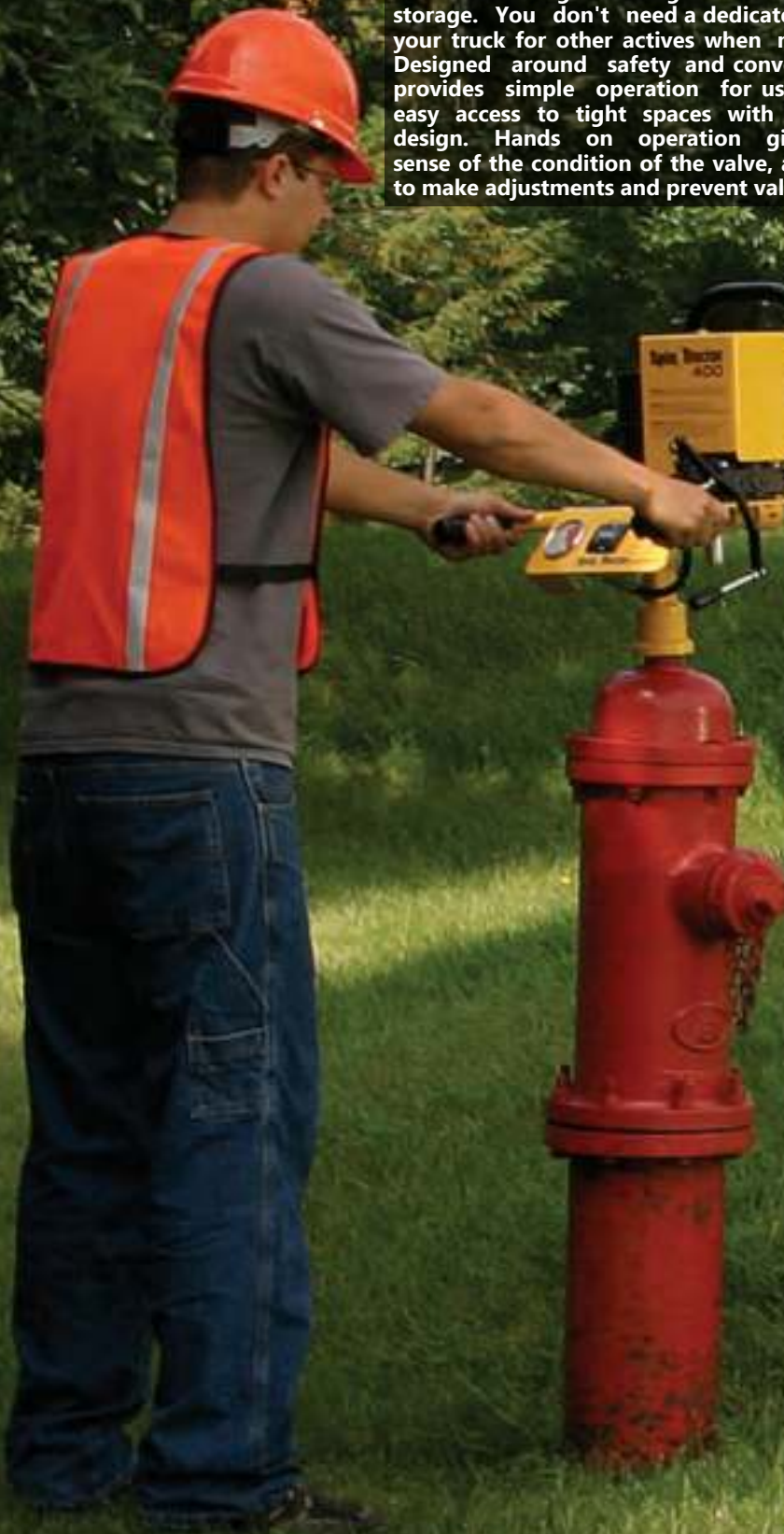
Optional 90° tilt to remove stubborn hydrant caps.

The Spin Doctor 400 is an affordable tool to handle the vast majority of valves while removing the burden from the operator. Strong enough to handle tough valves but light enough for easy removal for storage. You don't need a dedicated vehicle, freeing up your truck for other activities when not valve exercising. Designed around safety and convenience, the SD400 provides simple operation for users, and allows for easy access to tight spaces with the unique vertical design. Hands on operation gives the operator a sense of the condition of the valve, allowing the operator to make adjustments and prevent valve damage.