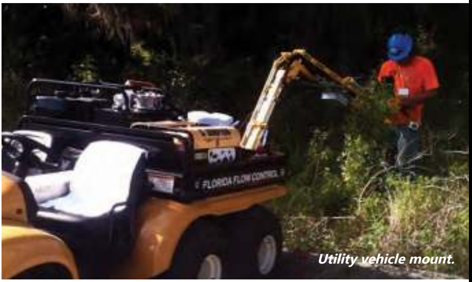
Utility vehicle mount.