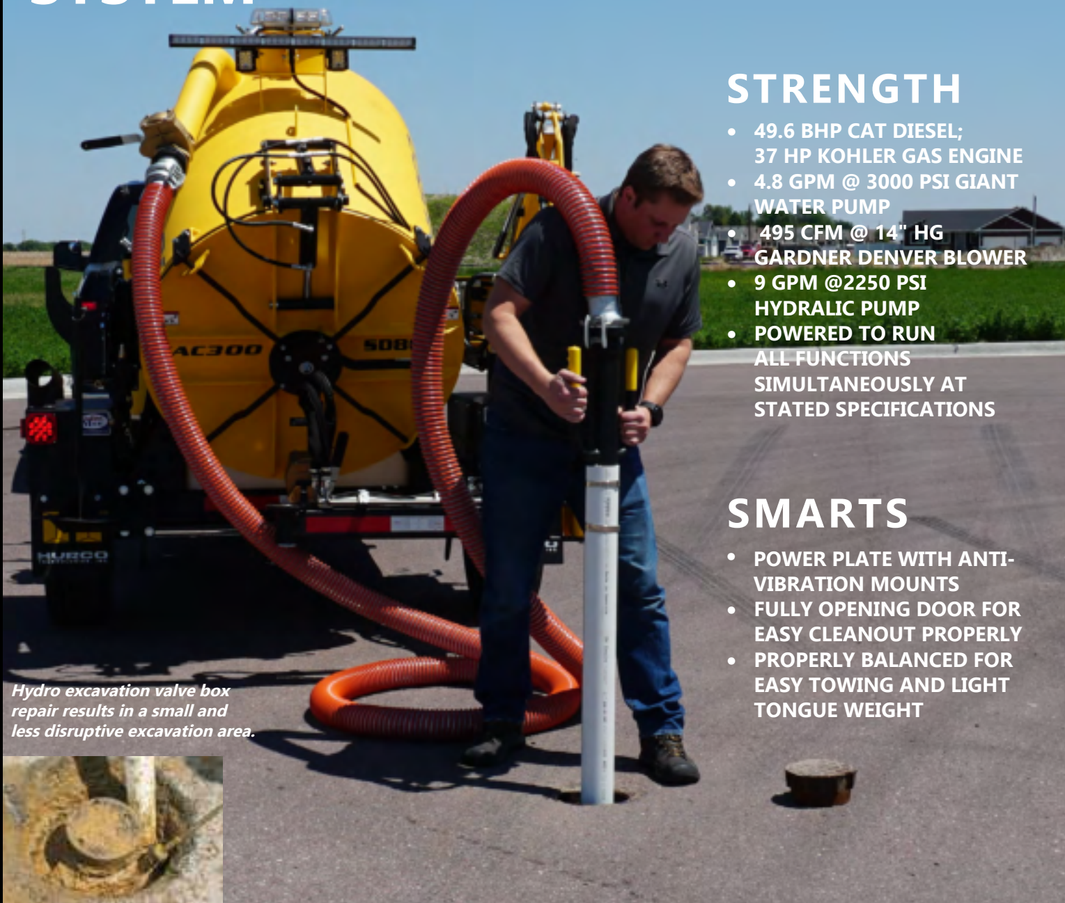
Hydro excavation valve box repair results in a small and less disruptive excavation area.