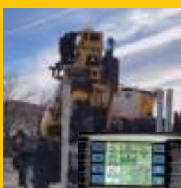
Critical data is collected on the Valve Star during valve exercising.