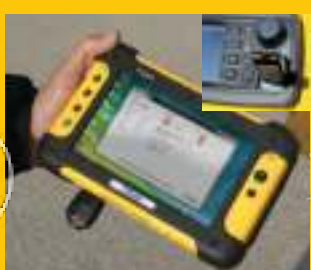
Data is transmitted to a field computer, or stored in the on-board computer and transferred to flash drive.