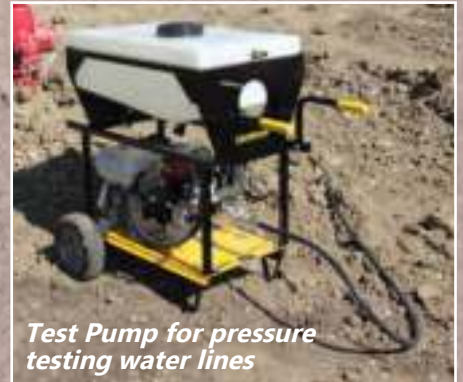
Test Pump for pressure testing water lines

VISIT OUR WEBSITE TO SEE OUR OTHER PRODUCT LINES