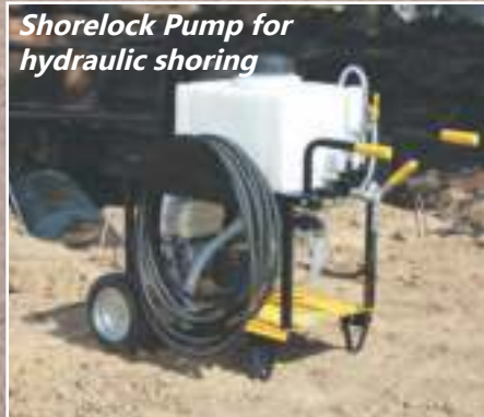
Shorelock Pump for hydraulic shoring