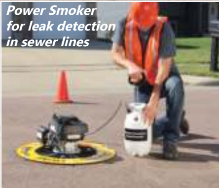
Power Smoker for leak detection in sewer lines