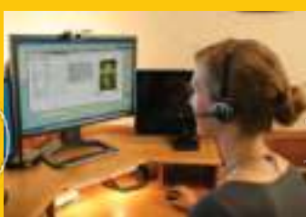
When testing activities are complete, data is transferred to an office computer.