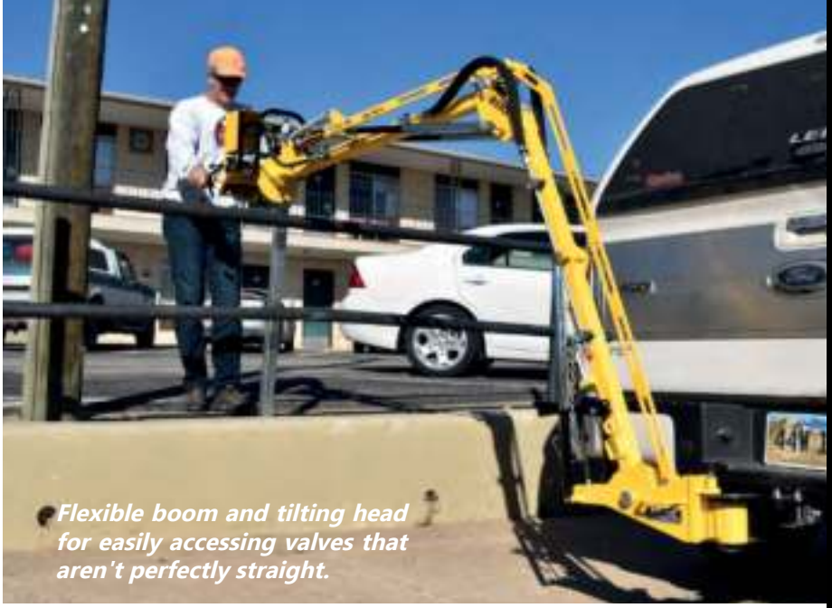
Flexible boom and tilting head for easily accessing valves that aren't perfectly straight.