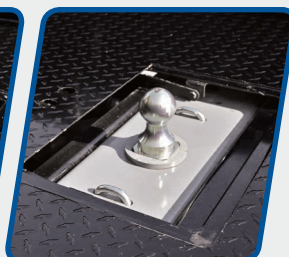
Ready to Connect

Visit our website at stahltruckbodies.com where you'll find everything you need to help you build a better Elite body including a: