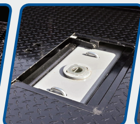
Access Plate Open