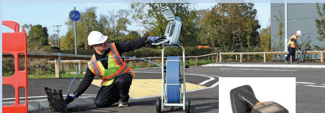
P341 Plumbers Reel