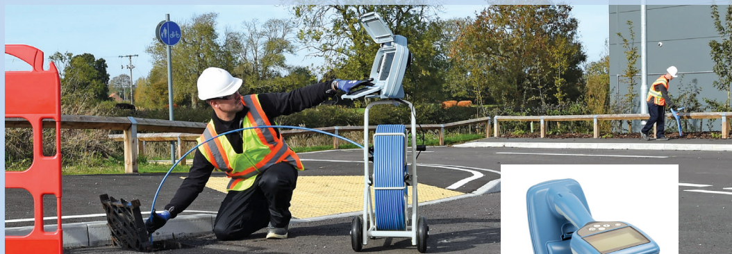
C541c Plumbers Reel