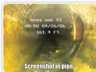
Screenshot in pipe

The Jet Eye system is compatible with all PC based reporting software systems.