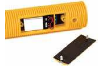
Easy Access Battery