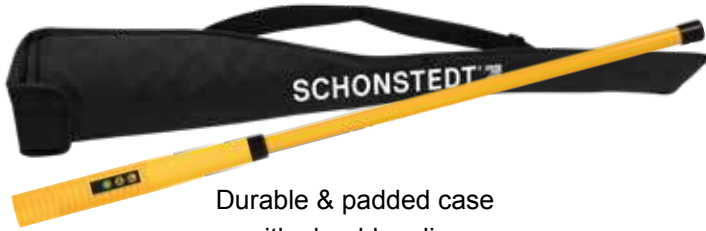
Durable & padded case with shoulder sling