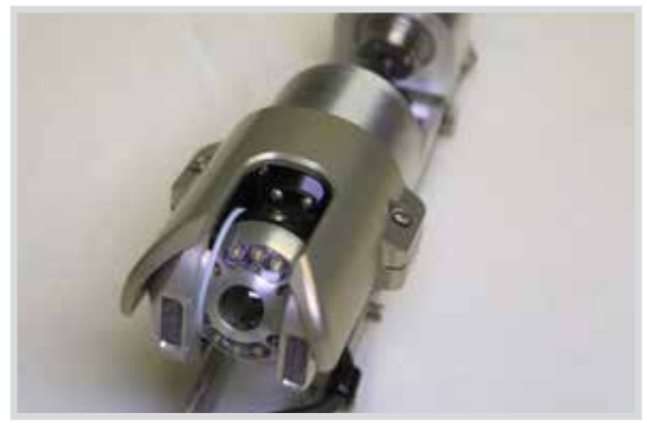
> CURRAHEE CUTTER CAMERA