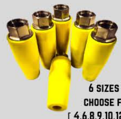
6 SIZES TO CHOOSE FROM [ 4, 6, 8, 9, 10, 12 SIZES ]

The performance of the Silencer's advanced stream technology is unmatched. Our tight, Zero Degree water stream, at up to 4200 PSI, rotates at an optimal speed to provide a 10-degree cone of ground or object coverage.